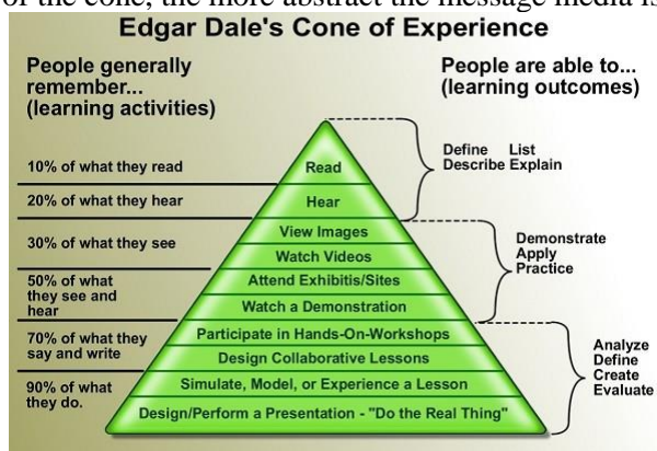
Figure 2: Krucut Dale

Dale in Davis & Summers (2015) said: "one's learning outcomes are obtained through direct experience (concrete), the reality that exists in one's living environment than through artificial objects, to verbal symbols (abstract). Increasingly to the top of the cone, the more abstract the message media is.