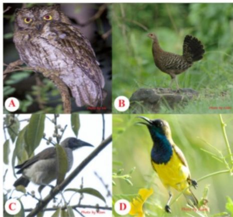
Figure 2. (A) Otus jolandae , (B) Gallus varius , (C) Philemon buceroides , (D) Cinnerys jugularis

ever, intensive research is still needed to ensure their conservation status. Some aspects of Otus jolandae to be explored further include is mapping the distribution, population density and habitat characteristics. The second priority is Gallus varius and Philemon buceroides caused by the capture or trade. The decline in the population of both species while also caused by the habitat decrease, economically sale value of both species can provide promised benefits for wildlife traders. In addition, until now there has been no serious effort to manage to increase population of both species.