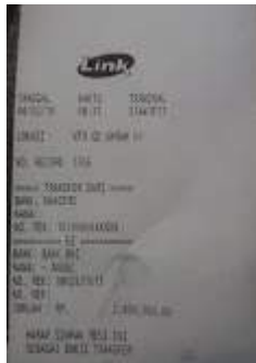
Bukti pembayaran AASEC 2019 Saprizal Hadisaputra.jpeg 27K