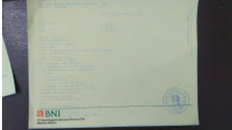
Payment Proof Saprizal Hadisaputra continue1.jpeg 106K