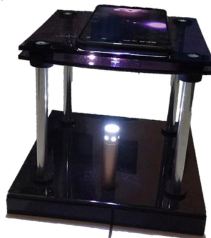
Figure 3: Microscope digital portable auto design

After conducting instructional analysis, characteristics of students, and mandated in the 2013 curriculum, the researchers developed of learning media of a microscope digital portable auto design. This media will take advantage of technological developments in the form of smartphones that are like the various features in the playstore. This microscope digital portable auto design uses a laser lens that will be combined with a smartphone that is then used to observe objects or insects that are micro-sized, such as the eyes of people's motion flies in the body to fleas and worms, organs in ants and insects such with that. The digital microscope design in question is shown in figure 3 below.