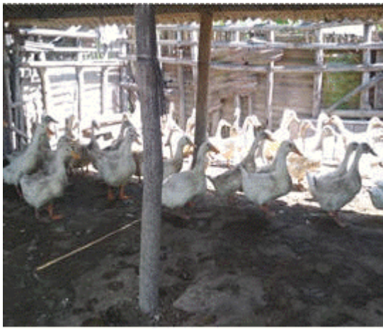
Photo 1. Pekin ducks under small holder rearing management