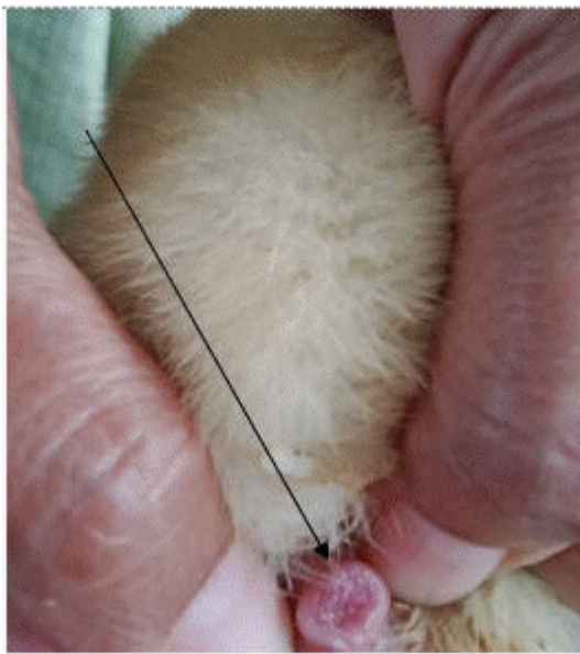
a. Female ducks at 2 weeks of age with no bulge