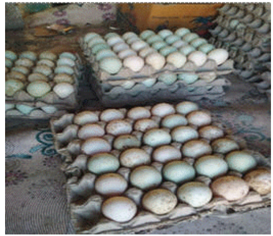
Photo 2. Collected fertile Pekin duck eggs