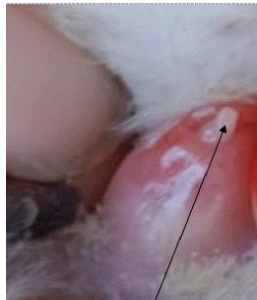
b. Male ducks at 2 weeks of age had a small bulge (in white color)