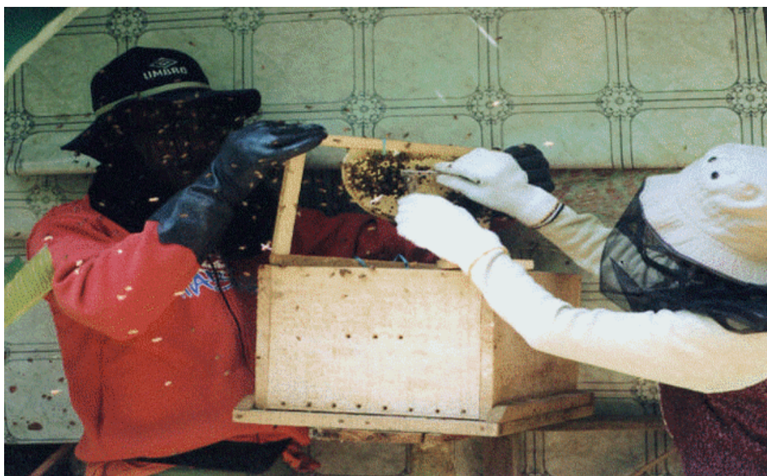
Photo 4. The collecting pupae before hatches to measure their hatches weight

The hatches of worker bees were taken five heads (replications) for each treatment (Photo 4), then put into a tube and weighed by using a digital scale and each twice measured. This process was performed every third week for about three months of the beekeeping.