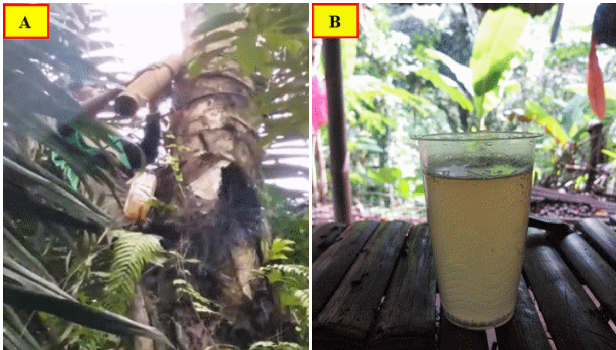
Photo 2. Sugar palm sap during the harvest process (A) and the sap was stored in the plastic glass (B)

The technique was used to give coconut sap, sugar palm sap, and sugar palm pollen according to the previous method reported by Erwan et al (2021). Briefly, the fresh coconut sap ( Cocos nucifera ), sugar palm sap ( Arenga pinnata ), and sugar palm pollen were obtained from North Duman Village, the Sub-district of Lingsar. Afterward, the fresh coconut and sugar palm saps were given to the bees by using plate plastic and split bamboo was supported by 4 to 5 of twigs as a foragers perch and placed at the distance of one meter from the box hives. The sugar palm pollen was hung in the wood at a height of 1.5 meters and placed besides the saps. To avoid the bees were collect sap and pollen from the other treatment, the box hives were placed at distance of 600 meters.