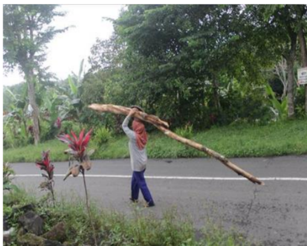
Figure 1. Activities of Collecting Firewood

The community has carried out these activities for a long time. Based on its historical background, people living in the Pesangrahan village have lived in the area for a long time and have been active in the forest area [16]. Since the designation of the area under BTNGR in 1997, the BTNGR has prohibited these activities. So, the community began to use the TNGR area covertly. In 2003, the village communities around the TNGR area were given the opportunity, informally, by the BTNGR officers to utilize grass in the TNGR area as their livestock feed. However, in practice, these utilization activities are not limited to the use of grass but also utilizes the TNGR area for several other activities such as collecting NTFPs, firewood, hunting, and farming, causing conflicts between the BTNGR officers and the local community.