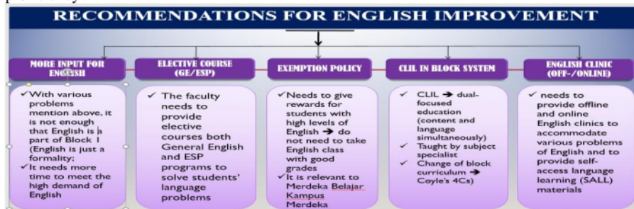
Diagram 2. Recommendation for English improvement for Faculty of Medicine

However, the products developed in the present research cannot be fully used due to the amount of time allocated other obstacles in the formal class. This research, therefore, provides further recommendations as to alternative solutions to the improvement of students' English proficiency. Presented below are the recommendations for the Faculty of Medicine to take for better English proficiency.