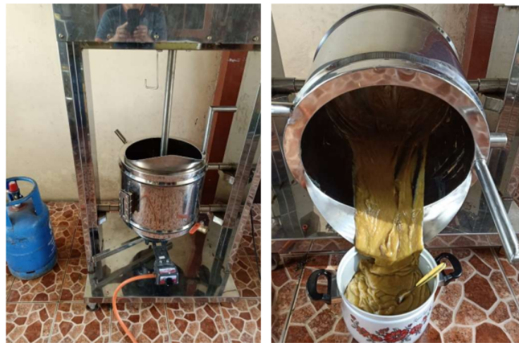
Figure 2 Fruit lunkhead stirrer machine

The fruit dodol before the drying process is first carried out by the heating process until it thickens. In the heating process, constant stirring is required. This stirring process takes quite a long time, namely \pm 3 hours. This process requires a large amount of physical energy, causes fatigue, especially when mixing the dough, and is a tough process. Lack of heating can cause the dodol product to suffer a rancid odor. Heating must be controlled because it affects the water content in lunkhead. Based on this, an automatic dodol stirrer is used as shown in Figure 2.