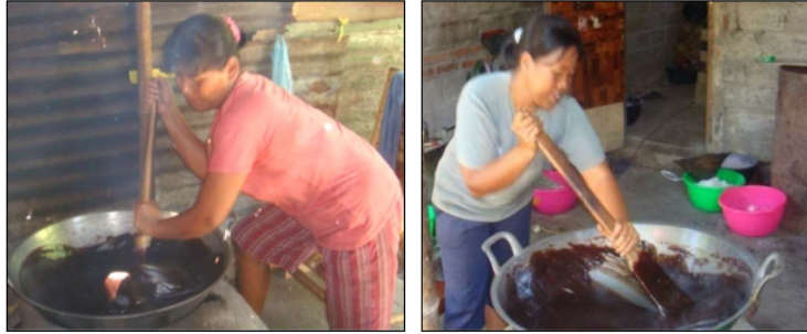
Figure 1 Work posture stirring lunkhead [3]

Investment feasible analysis aims to determine the possibility of profitability obtained by both companies and workers in the short and long term. In addition, this analysis is carried out to determine the level of benefit from investment. To determine the investment feasibility (economic aspect) of fruit dodol , an analysis was carried out based on the Payback Period (PBP), Break Even Point (BEP), and Return on Investment (ROI) methods. BEP is a point or condition that a company does not gain and does not suffer losses [4]. Return on Investment (ROI) is the profit obtained from a certain amount of capital . This value can be used to determine the efficiency of using capital. ROI is the company's ability to generate profits that will be used to cover the investment issued. This ratio relates the profit obtained from the company's operations (net operating income) with the amount of investment or assets used to generate operating profits .