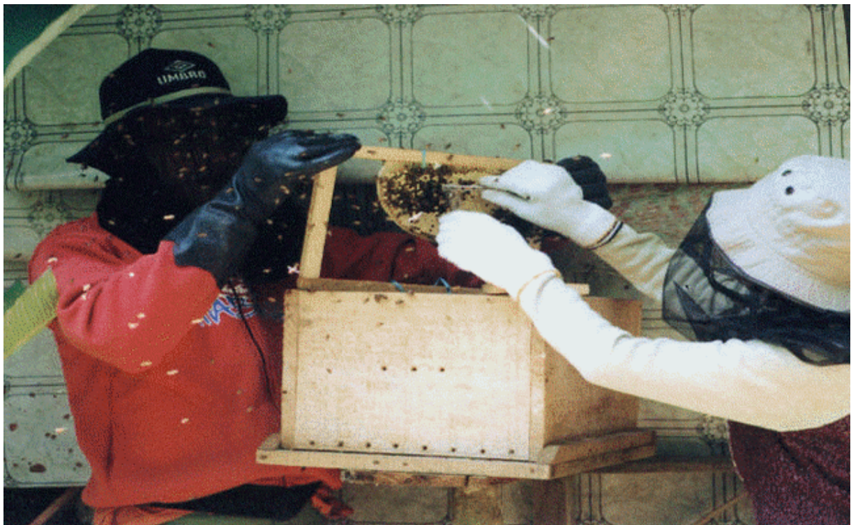
Photo 4. The collecting pupae before hatches to measure their hatches weight

The hatches of worker bees were taken five heads (replications) for each treatment (Photo 4), then put into a tube and weighed by using a digital scale and each twice measured. This process was performed every third week for about three months of the beekeeping.