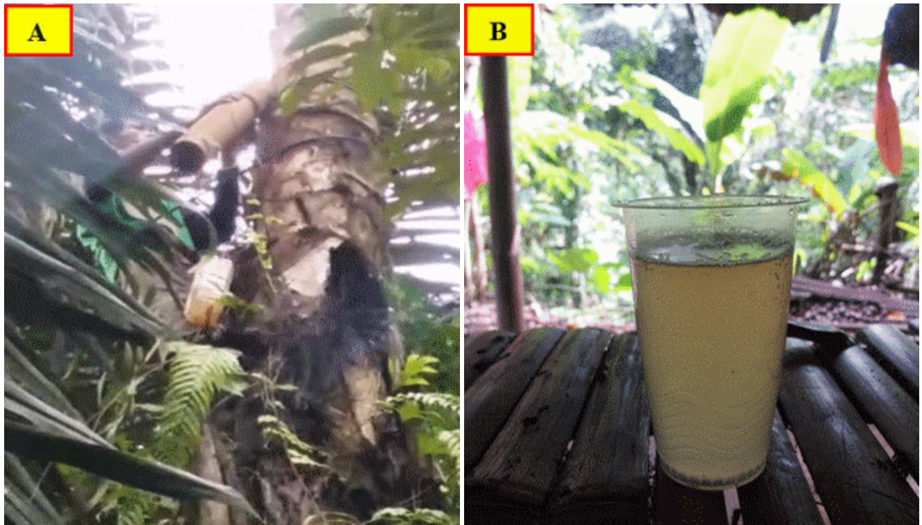
Photo 2. Sugar palm sap during the harvest process (A) and the sap was stored in the plastic glass (B)