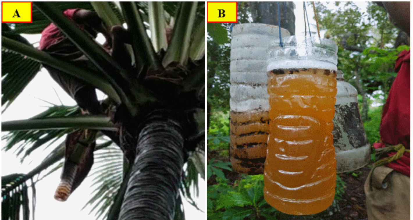
Photo 1. Coconut sap during the harvest process (A) and the sap was stored in the plastic bottles (B)

This study was performed in the Village of North Duman, Sub-district of Lingsar (West Lombok District, West Nusa Tenggara Province, Indonesia). This study used 30 colonies of the bee A. cerana by using a randomized complete block design with the factorial 3×2 and 5 replications. The first factor was plant sap, which consists of three subfactors were coconut sap (C) (Photo 1), sugar palm sap (S) (Photo 2), and a mix of 50% coconut sap + 50% sugar palm sap (SC). The second factor was sugar palm pollen consisting of two subfactors were added by sugar palm pollen (P) and without sugar palm pollen. The treatment in our study consisted of sugar palm sap without added by sugar palm pollen (SP0); coconut sap without added by sugar palm pollen (CP0); 50% of coconut sap + 50% of sugar palm sap without added by sugar palm pollen (SCP0); sugar palm sap was added by sugar palm pollen (SP1); coconut sap was added by sugar palm pollen (CP1); 50% of coconut sap + 50% sugar palm sap was added by sugar palm pollen (SCP1).