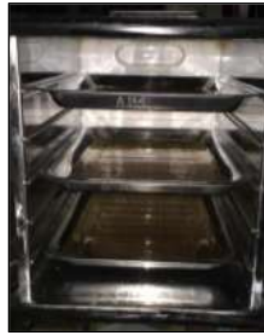
Figure 1. Dehumidifier use to decrease the amount of moisture content in honey sample

This research is focused in reducing the moisture content of honey using two different methods, dehumidifier process and evaporation process. Figure 1 showed the dehumidifier process of honey placed on the trays in order to reduce its moisture content. While Figure 2 showed evaporation process of honey in order to reduce its moisture content. Figure 3. below are explaining the comparison of honey's moisture content reduced rate in between dehumidifier an evaporation method a long with the duration of processes.