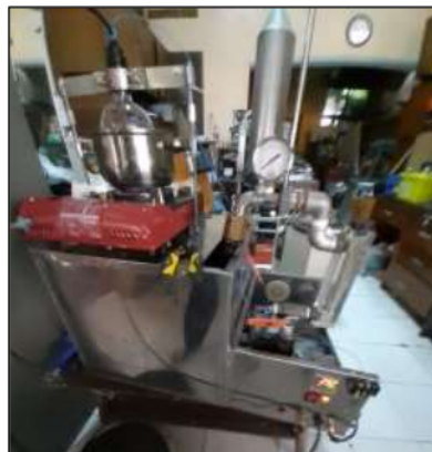
Fig. 2. The evaporator used to lower the moisture content in honey