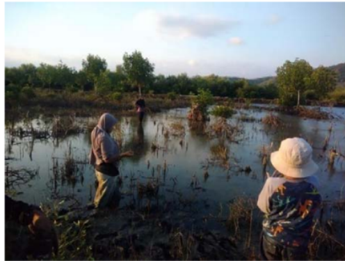
Figure 2. Illegal Logging at Zone 5