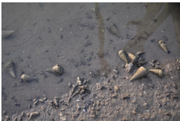
Figure 4b. Some biotas in R. stylosa plot.