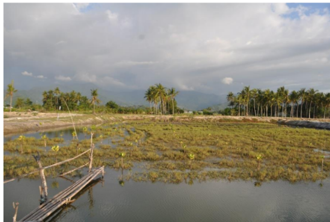
Figure 3. Grass colonizing rehabilitation site in R. mucronata plot.

CV bigger than 10% is used as an indicator that the ecosystem or the species is unhealthy [29]. R. mucronata CV is 15%, hence, attention should be directed to this plot. Based on observation, one possible reason for this is its distance from the coastline (sea) which results in less inundation period. Rhizophora, sp. grows best in areas that are inundated during at least medium tide [30] or at least 20 days a month, twice a day [31]. During the dry season, some parts of the R. mucronata plot is not inundated for several weeks. Less inundation has enabled grass to colonize the floor (Figure 3). There is a high competition for nutrients between the mangrove seedlings and the grass. The ability of leaves to maintain leaf area index is highly dependent on the ability of the tree to concentrate and transport nutrients and fresh water into the leaves [29].