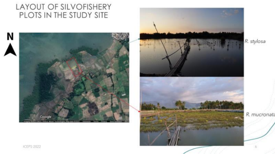
Figure 1. Study site.

In each plot, forty healthy leaves of mangrove seedlings were collected. Leaf width and leaf length were measured to gain the morphometric ratios. Water quality parameters (dissolved oxygen, soil pH, water pH, salinity and water temperature) were collected in five spots in each plot (Figure 2). Yellow and blue dots represent the spot where environmental data were collected.