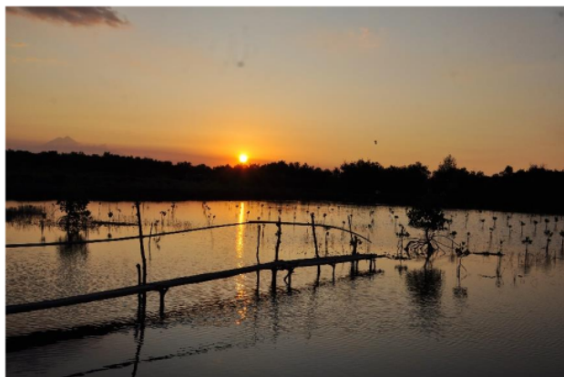
Figure 4a. R. stylosa plot.