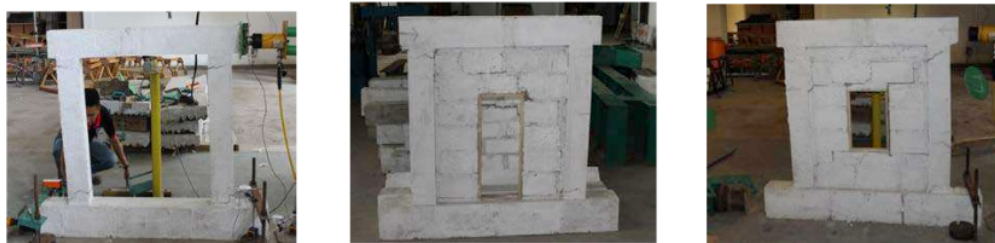
Fig. 2. Failure Pattern of F0 (left), F2 (middle) and F3 (right)

It has also been noticed from the physical test result that all of the frames had typical cracks propagation in the form of diagonally spread in the infill wall. The cracks approximately made a 45-degree angle which begun from the top compression corner to the base of the frame linked with horizontal sliding cracks developed along the bed joint near the mid-height of the infill wall. These cracks can be seen in Figs. 2 (left), (middle) and (right) for F0, F2 and F3 respectively.