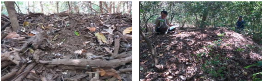
Figure 1 Profile of Megapodius reinwardt nest on Moyo Island 2017

Based on topography of Moyo Island which is hilly and mountainous, mostly in the form of forest, sea, the existence of human settlements and the accessibility is still relatively difficult and expensive, in this study the data collection about population distribution Megapodius reinwardt only conducted in the western part of the South Island of the five locations: in the area of Labuhan Haji hamlet, Berang Sedo hamlet, Ai Manis hamlet, Ai Dara and Tanjung Pasir. The description of Megapodius reinwardt 's nest and its spreading on Moyo Island 2017 is presented below.