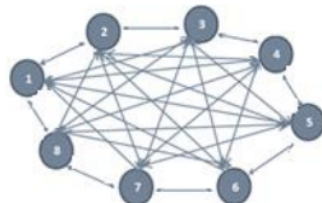
Figure 2. Non-coprime graph of \mathbb{Z}_9

Example 2. Let \mathbb{Z}_{3^2} = \{0, 1, 2, 3, 4, 5, \dots, 8\} . As we can see, |1| = 9, |2| = 9, |3| = 3, |4| = 9, |5| = 9, |6| = 3, |7| = 9, |8| = 9 . Consequently, we have that a and b are adjacent in \bar{\Gamma}_{\mathbb{Z}_{3^2}} for all a, b \in \mathbb{Z}_{3^2} - \{0\} . The non-coprime graph of \mathbb{Z}_{3^2} is shown in Figure 2.