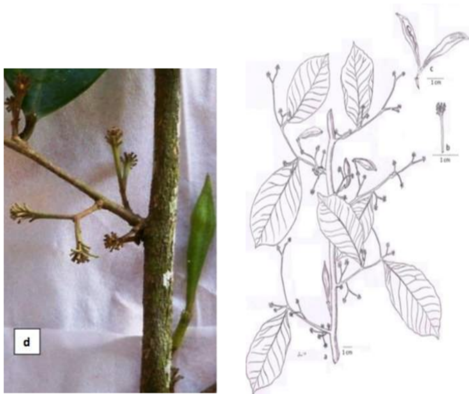
FIGURE 2. Aquilaria malinensis : a. Branchlet with fruit, b. inflorescence, c. fruit, d. inflorescences and fruit.

inserted in the costae at the throat. Fruit narrowly obovate, strigulose sparsely, stipes as length as the seed, caruncle J form, in A. malinensis while A. beccariana the inflorescences umbel – compound umbel, the fruit widely hexagonal, thin, contracted in the middle, white puberulent scattered, stipes as length as seed, caruncle deep question mark form.