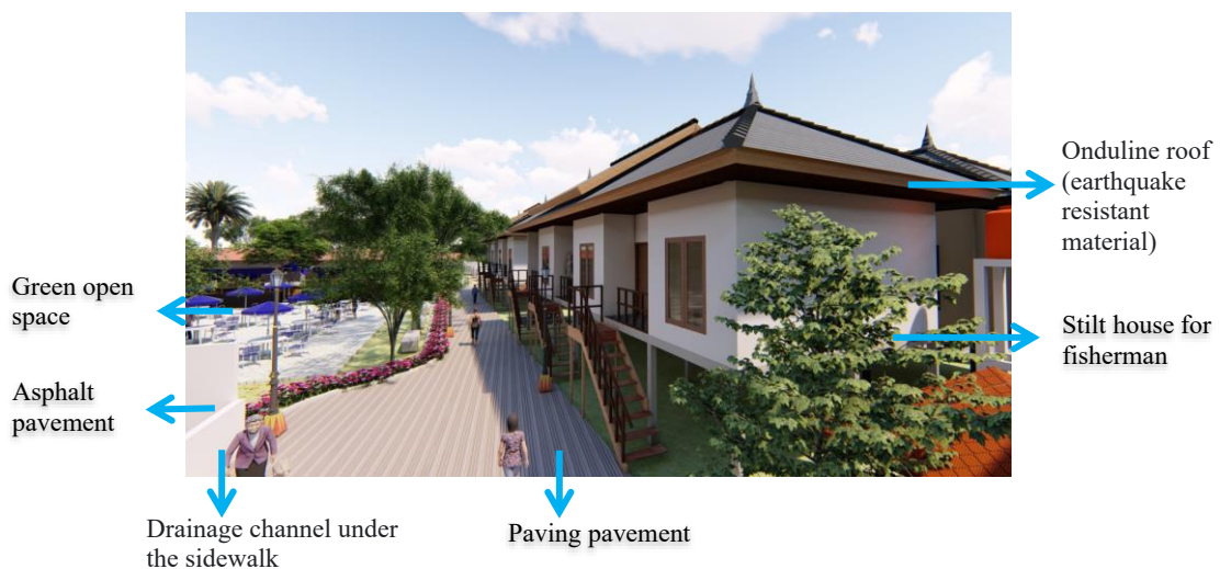
Figure 5. Planning of fishermen's settlements in Kuta (Mandalika)

Based on facts above, the planning of fishing village in Kuta beach (Mandalika) is proposed as Figure 3 until Figure 5. Figure 5 illustrates that a healthy environment can be planned by designing environmentally friendly infrastructure. For example: for fishermen's settlements, houses are designed on stilts so that if sea water rises, water will not enter the house. The building materials are also