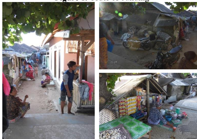
Figure 2. House building and waste conditions