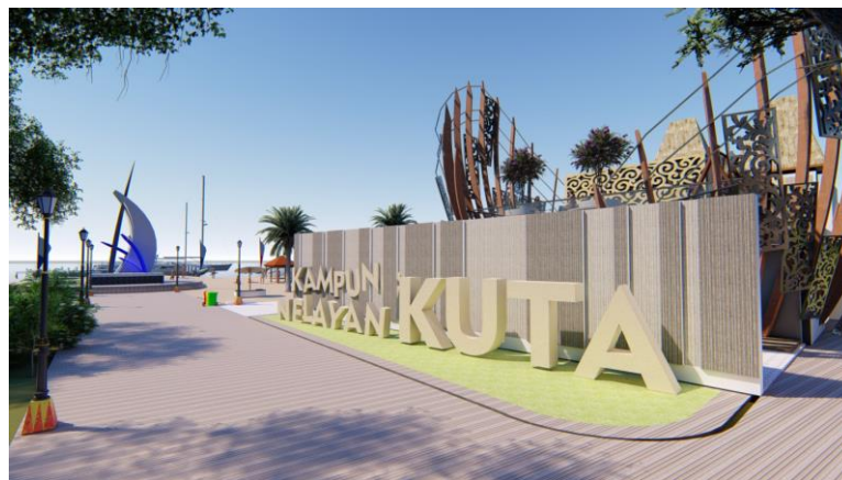
Figure 4. Iconic fonts area of Kuta (Mandalika)

The density of buildings in the Kuta fishing village area is the cause of the lack of quality open spaces. This density needs to be broken down so that the solid-void area becomes better. In this open space, facilities for supporting community activities can be built. Thus, the livelihoods of the people living in this area will be of higher quality. In addition, the existence of green open space will be able to support the potential that exists in the area, for example tourism potential.