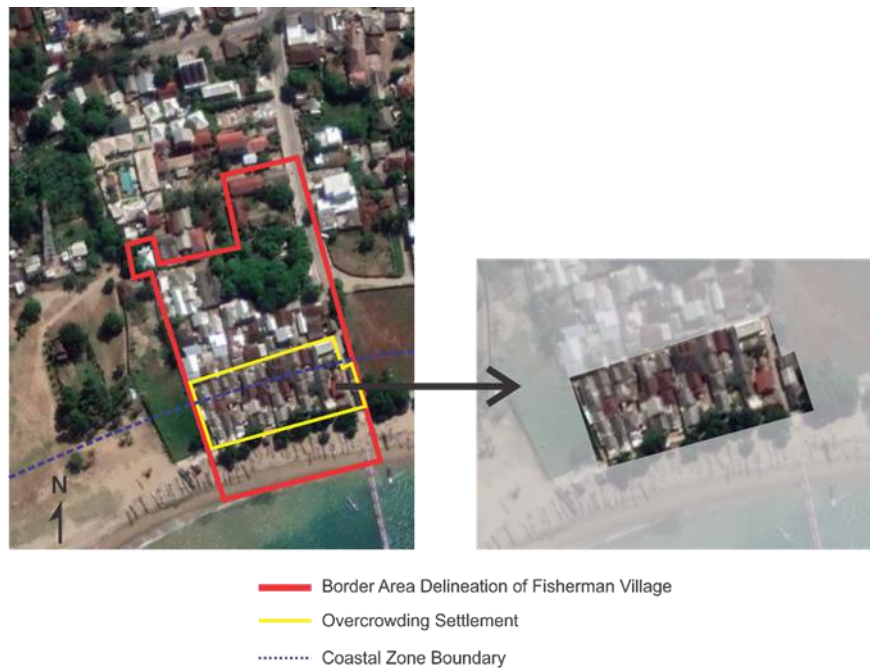
Figure 1. Order of building

The Kuta fishing village area requires solid waste management that can accommodate the volume of residents' waste while being designed with a neat design so that it looks clean. Garbage collection by managers must also consider special access so as not to interfere with activities or damage the comfort of residents.