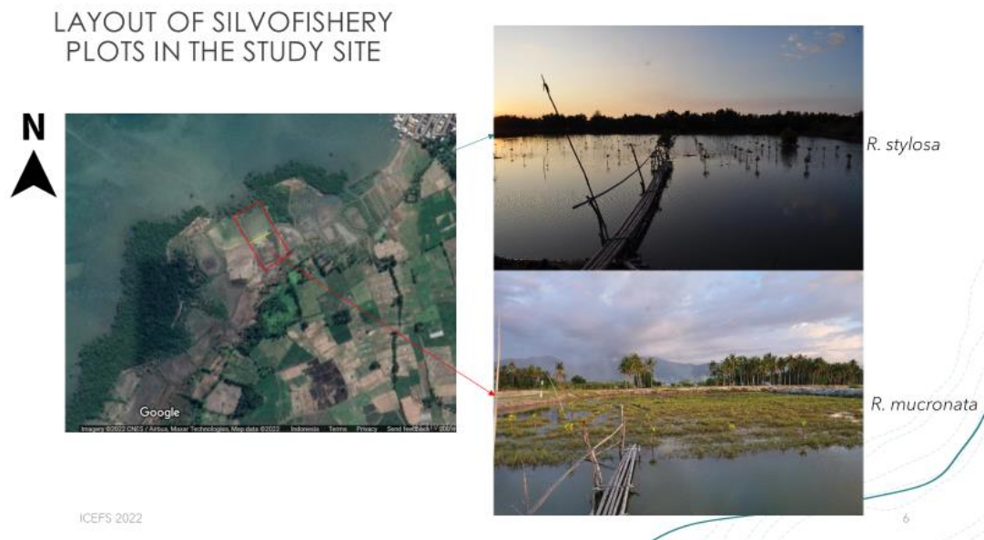
Figure 1. Study site.

In each plot, forty healthy leaves of mangrove seedlings were collected. Leaf width and leaf length were measured to gain the morphometric ratios. Water quality parameters (dissolved oxygen, soil pH, water pH, salinity and water temperature) were collected in five spots in each plot (Figure 2). Yellow and blue dots represent the spot where environmental data were collected.