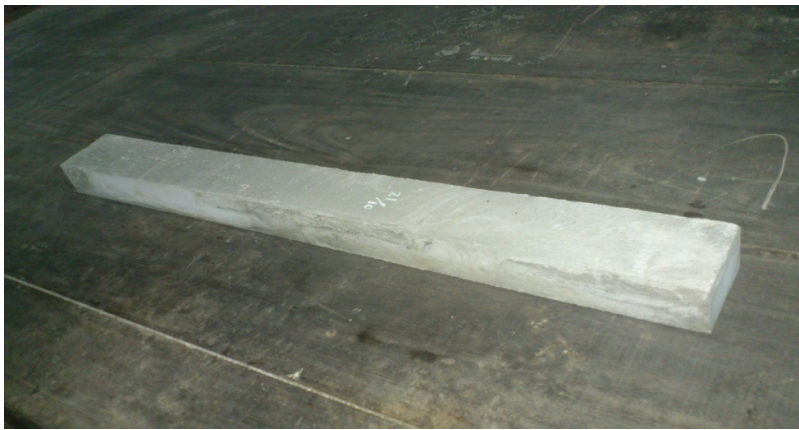
Figure 1 Test specimens for shrinkage investigations.

Concrete mortar consists of sand, cement and water was employed in order to examine the plastic shrinkage and micro cracks investigation. The concrete mortar size of 60 mm x 100 mm x 1000 mm was used to investigate the plastic shrinkage. The dosage of polypropylene fiber used in this test has five variations of 0.1%, 0.2%, 0.3%, 0.4%, and 0.5% to the mortar volume. Meanwhile, to examine water loss due to evaporation and plastic cracks of concrete, mortar specimen with dimensions of 50 mm x 200 mm x 350 mm was employed. Similar to the micro cracks investigation, the dosage of polypropylene fiber used in this test has also five variations of 0.1%, 0.2%, 0.3%, 0.4%, and 0.5% to the mortar volume. The test specimen for shrinkage investigations can be seen in Figure 1, whilst Figure 2 presents the test specimens for micro cracks investigations.