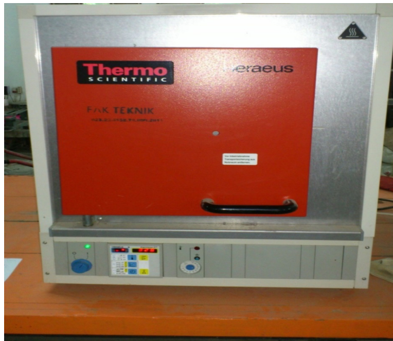
Figure 5. Thermo scientific furnace with capacity up to 1200°C

The fire resistance test was carried out at concrete 50 days of age. At that time, the condition of the concrete can be said to have low humidity with a balance of moisture content. This balance is achieved if two consecutive weightings carried out at 24 hours intervals do not produce a difference of more than 0.1% of the weight of the test object. Fire resistance test was carried out using a furnace that has a capacity of up to 1200°C shown in Figure 5.