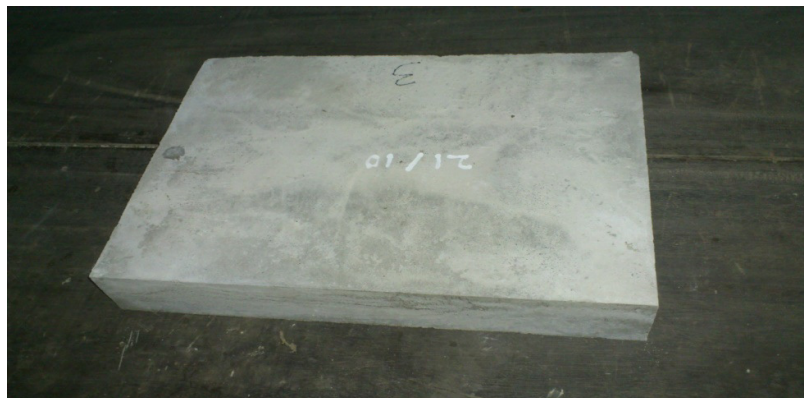
Figure 2. Test specimen for micro cracks investigations