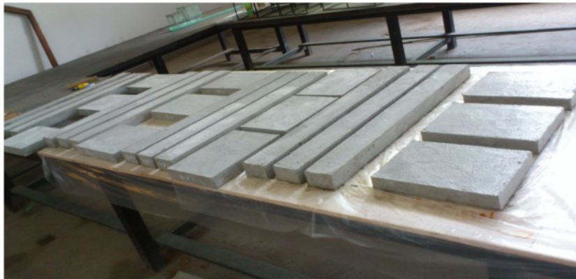
Figure 4. Specimens treatment in high temperature and low humidity room

The test is carried out in a room set with high temperature and low humidity to accelerate shrinkage and micro cracks. The treatment of the specimens in the room can be seen in Figure 4. Longitudinal shrinkage of the specimen was measured with a length measuring instrument and micro cracks were scrutinized with a microscope.