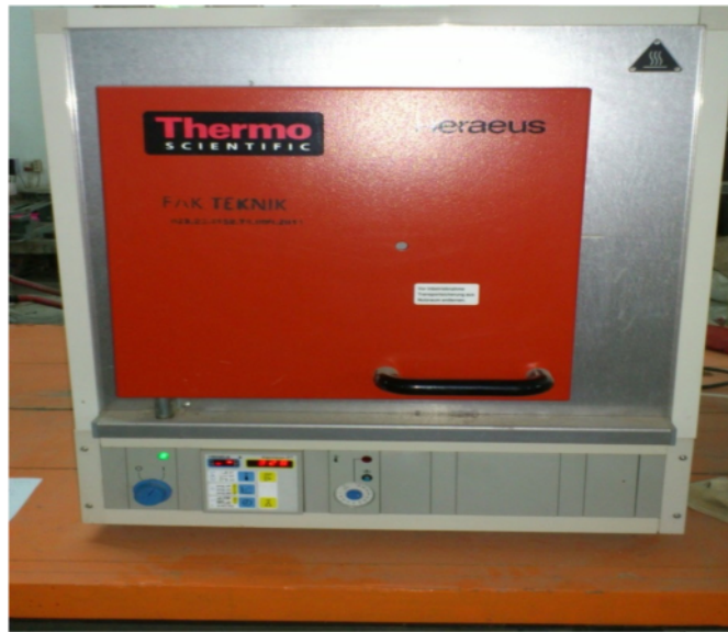
Figure 5. Thermo scientific furnace with capacity up to 1200°C

The fire resistance test was carried out at concrete 50 days of age. At that time, the condition of the concrete can be said to have low humidity with a balance of moisture content. This balance is achieved if two consecutive weightings carried out at 24 hours intervals do not produce a difference of more than 0.1% of the weight of the test object. Fire resistance test was carried out using a furnace that has a capacity of up to 1200°C shown in Figure 5.