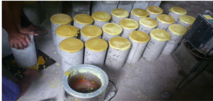
Figure 3. Test specimens for concrete under elevated investigation

2.1.2. Specimens for elevated temperature investigations. The specimens for elevated temperature investigation with standard cylindrical size of 15 mm diameter and 30 mm height were employed. Various polypropylene dosages of 0 kg/m 3 , 1.5 kg/m 3 , 2.0 kg/m 3 , 2.5 kg/m 3 , dan 3.0 kg/m 3 to the concrete volume were utilized. The test specimens for concrete under elevated temperature investigation can be seen in Figure 3.