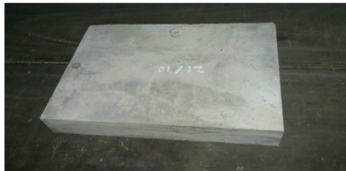
Figure 2. Test specimen for micro cracks investigations