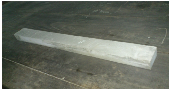
Figure 1 Test specimens for shrinkage investigations.

Concrete mortar consists of sand, cement and water was employed in order to examine the plastic shrinkage and micro cracks investigation. The concrete mortar size of 60 mm x 100 mm x 1000 mm was used to investigate the plastic shrinkage. The dosage of polypropylene fiber used in this test has five variations of 0.1%, 0.2%, 0.3%, 0.4%, and 0.5% to the mortar volume. Meanwhile, to examine water loss due to evaporation and plastic cracks of concrete, mortar specimen with dimensions of 50 mm x 200 mm x 350 mm was employed. Similar to the micro cracks investigation, the dosage of polypropylene fiber used in this test has also five variations of 0.1%, 0.2%, 0.3%, 0.4%, and 0.5% to the mortar volume. The test specimen for shrinkage investigations can be seen in Figure 1, whilst Figure 2 presents the test specimens for micro cracks investigations.