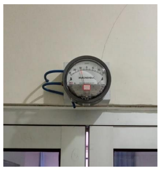
Figure 4. Implanted pressure gauge (magnehelic®)