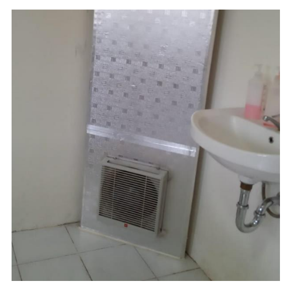
Figure 3. Outlet duct with 25cm in diameter. There are two outlet ducts in each NPIR