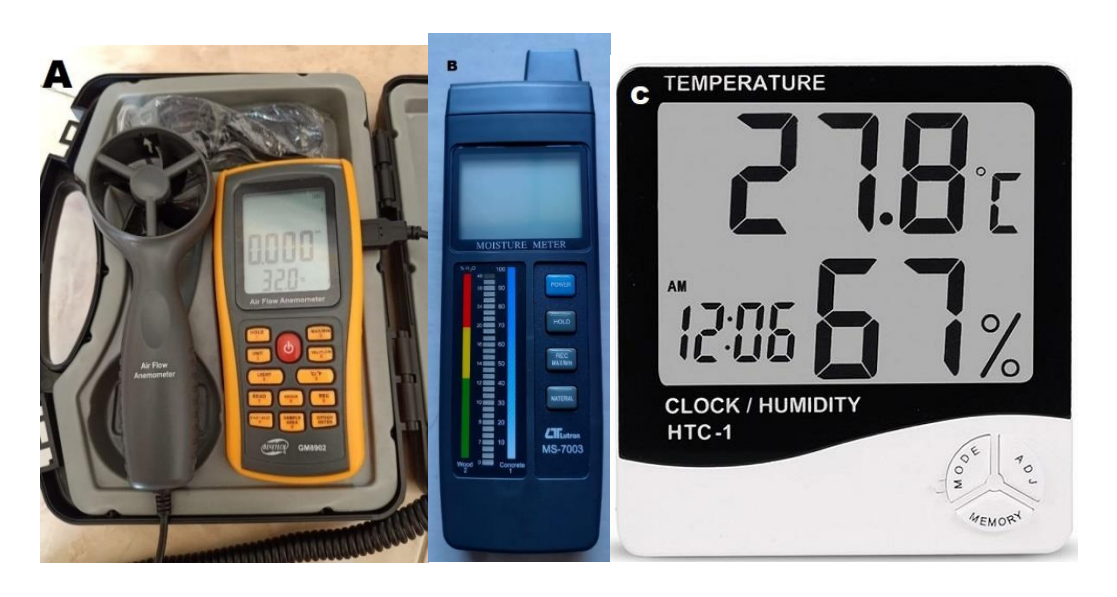
Figure 1. Instruments used in the study. A=anemometer (GM8902 Benetech®); B=moisture meter (MS-7003, Lutron); C=hygrometer (HTC-1®)

ACH = 3.600 \, \sec X \frac{\left[mean \, air \, velocity \, outlet \, \left(\frac{m}{s}\right) x \, outlet \, duct \, wide \, (m2)\right] - \left[mean \, air \, velocity \, inlet \, \left(\frac{m}{s}\right) x \, inlet \, duct \, wide \, (m2)\right]}{Room \, Volume \, (m3)}