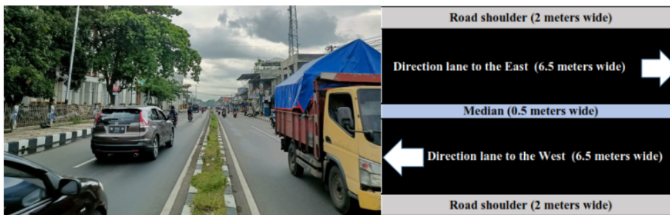
Figure 2. Section road condition with median type 4/2 D

Based on the direct measurement survey in the field, the geometric conditions of the research site roads were obtained. The road section under consideration has a flat terrain type with asphalt pavement. Traffic lane width per lane E-W and W-E is 3.25 and 3.25, respectively. The median width is 0.5 meters, with the road facility as a curb. The distance between the curb and the barrier for each side of the road is 1.0 meters.