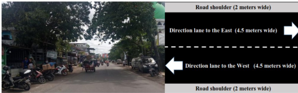
Figure 1. Condition of section road without median type 2/2 UD