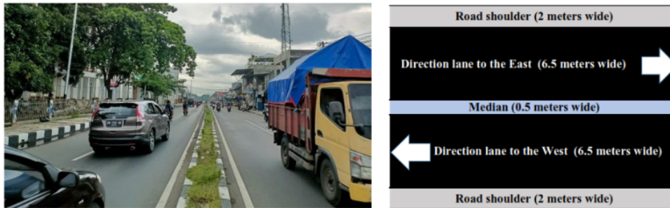
Figure 2: Section road condition with median type 4/2 D

and the barrier for each side of the road is 1.0 meters.