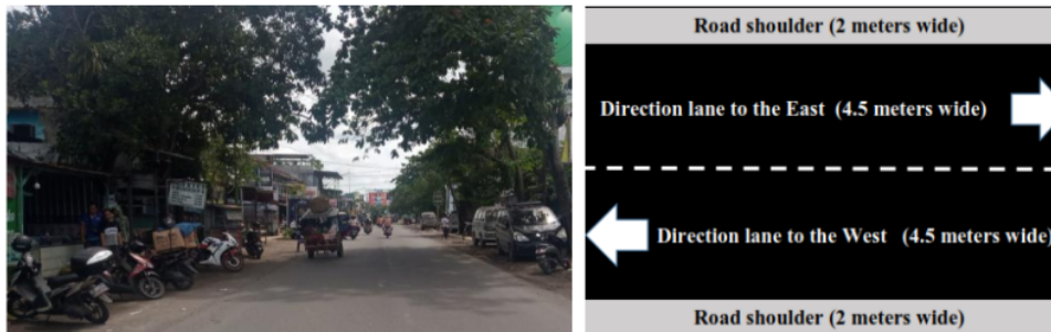
Figure 1: Condition of section road without median type 2/2 UD