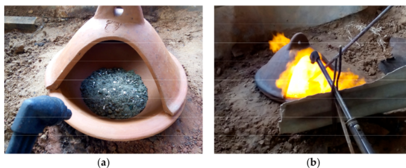
Figure 5. Final extraction process using silver as a collector metal before (a) and during smelting (b).

There was no visible separation of metal product within the smelt product (slag). To further process the slag, silver (99%), purchased from a gold shop in the city of Mataram, was used as a collector metal during a second smelt. The 1.23 kg of slag was crushed by hand and then mixed with a further 250 g of borax. Silver pieces (30.97 g) were then spread over the surface of the slag/borax mix, the clay pot covered, and a second smelt run for 1.5 h (temperature greater than 1000 °C) using an oxy-acetylene torch and compressed air (Figure 5). The smelt finished when the slag had completely melted and the silver had formed a single piece of visible bullion. The slag was then cooled for 2 min and poured on a flat surface and the silver recovered (38.74 g).