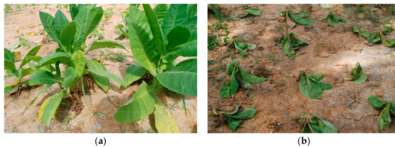
Figure 2. Tobacco plants before (a) and after (b) irrigation of the tailings surface with NaCN.

Tobacco was grown for 2.5 months with no watering or pest control employed (Figure 2a). Weeding was conducted by hand every three weeks to manage the growth of weed grass species across the plot area.