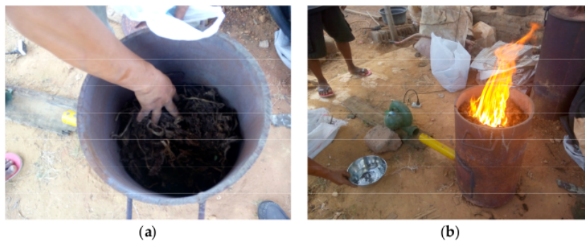
Figure 3. Loading the sun dried biomass into a steel drum (a) and burning the biomass to generate a plant ash (b).

Hydrometallurgical flow-sheets to recover gold (or other metals) from ore are generally not optimised to material that has a high concentration of organic matter, and are therefore poorly suited to the processing of biomass. This has been a major impediment to the development of an economically viable biomass processing system to support the commercial roll-out of phytomining [11]. The first step in proposed flow-sheets for biomass processing is to reduce the biomass to ash [13,22], and this first step was employed in the current study (Figure 3). Burning of carbon is a common practice at ASGM locations in Indonesia where miners burn the activated carbon recovered from the cyanidation process (CIL). Dry biomass was treated in the same way as activated carbon, and ashed in a clay pot with forced air as an additional oxidant (Table 3). The final mass of ash was 5.54 kg from the 20 kg of dry biomass. This is a mass reduction by a factor of 4. Complete burning of all organic material in the biomass should yield a mass reduction by a factor of greater than 10. Therefore, ashing was incomplete.