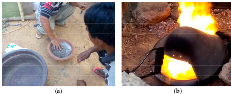
Figure 4. Mixture of plant ash and borax (a) and smelting the tobacco ash (b).

There was no visible separation of metal product within the smelt product (slag). To further process the slag, silver (99%), purchased from a gold shop in the city of Mataram, was used as a collector metal during a second smelt. The 1.23 kg of slag was crushed by hand and then mixed with a further 250 g of borax. Silver pieces (30.97 g) were then spread over the surface of the slag/borax mix, the clay pot covered, and a second smelt run for 1.5 h (temperature greater than 1000 °C) using an oxy-acetylene torch and compressed air (Figure 5). The smelt finished when the slag had completely melted and the silver had formed a single piece of visible bullion. The slag was then cooled for 2 min and poured on a flat surface and the silver recovered (38.74 g).