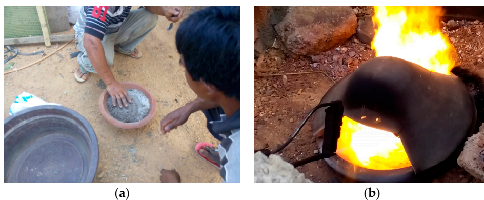
Figure 4. Mixture of plant ash and borax (a) and smelting the tobacco ash (b).

There was no visible separation of metal product within the smelt product (slag). To further process the slag, silver (99%), purchased from a gold shop in the city of Mataram, was used as a collector metal during a second smelt. The 1.23 kg of slag was crushed by hand and then mixed with a further 250 g of borax. Silver pieces (30.97 g) were then spread over the surface of the slag/borax mix, the clay pot covered, and a second smelt run for 1.5 h (temperature greater than 1000 °C) using an oxy-acetylene torch and compressed air (Figure 5). The smelt finished when the slag had completely melted and the silver had formed a single piece of visible bullion. The slag was then cooled for 2 min and poured on a flat surface and the silver recovered (38.74 g).