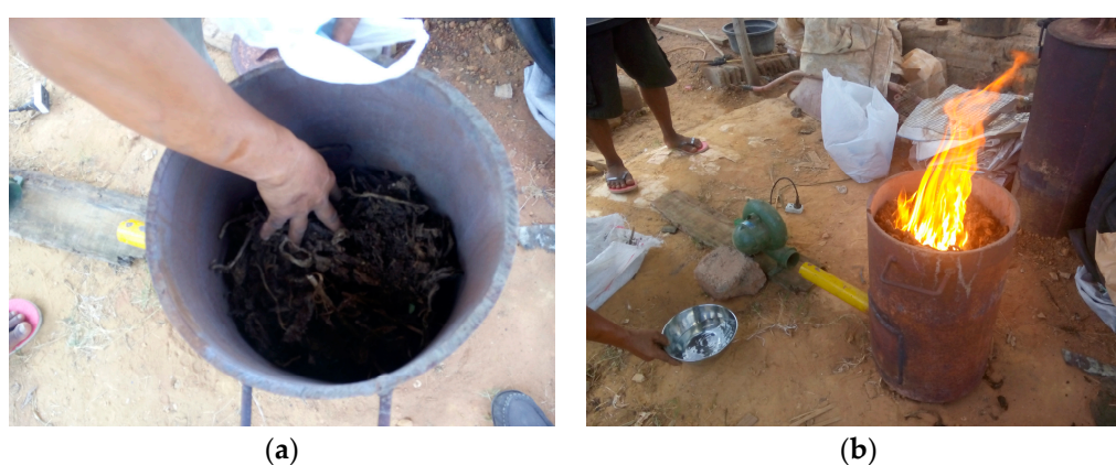
Figure 3. Loading the sun dried biomass into a steel drum (a) and burning the biomass to generate a plant ash (b).

Hydrometallurgical flow-sheets to recover gold (or other metals) from ore are generally not optimised to material that has a high concentration of organic matter, and are therefore poorly suited to the processing of biomass. This has been a major impediment to the development of an economically viable biomass processing system to support the commercial roll-out of phytomining [11]. The first step in proposed flow-sheets for biomass processing is to reduce the biomass to ash [13,22], and this first step was employed in the current study (Figure 3). Burning of carbon is a common practice at ASGM locations in Indonesia where miners burn the activated carbon recovered from the cyanidation process (CIL). Dry biomass was treated in the same way as activated carbon, and ashed in a clay pot with forced air as an additional oxidant (Table 3). The final mass of ash was 5.54 kg from the 20 kg of dry biomass. This is a mass reduction by a factor of 4. Complete burning of all organic material in the biomass should yield a mass reduction by a factor of greater than 10. Therefore, ashing was incomplete.