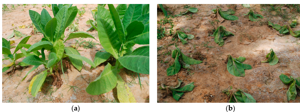
Figure 2. Tobacco plants before (a) and after (b) irrigation of the tailings surface with NaCN.

Tobacco was grown for 2.5 months with no watering or pest control employed (Figure 2a). Weeding was conducted by hand every three weeks to manage the growth of weed grass species across the plot area.