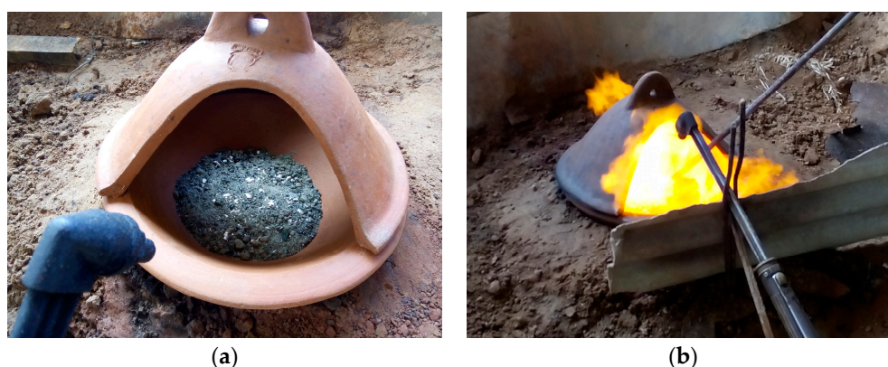
Figure 5. Final extraction process using silver as a collector metal before (a) and during smelting (b).

There was no visible separation of metal product within the smelt product (slag). To further process the slag, silver (99%), purchased from a gold shop in the city of Mataram, was used as a collector metal during a second smelt. The 1.23 kg of slag was crushed by hand and then mixed with a further 250 g of borax. Silver pieces (30.97 g) were then spread over the surface of the slag/borax mix, the clay pot covered, and a second smelt run for 1.5 h (temperature greater than 1000 °C) using an oxy-acetylene torch and compressed air (Figure 5). The smelt finished when the slag had completely melted and the silver had formed a single piece of visible bullion. The slag was then cooled for 2 min and poured on a flat surface and the silver recovered (38.74 g).