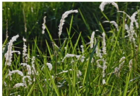
Figure 12. Imperata cylindrica

Imperata cylindrica (Alang-alang), has the lowest percentage of other grasses. reeds are a type of grass originating from tropical and subtropical regions in Asia, Africa and Australia. This grass can grow to a height of about 1-2 meters and has roots that can grow very deep in the ground.