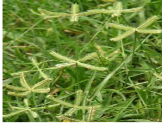
Figure 8. Dactyloctenium aegyptium

Furthermore, Dactyloctenium aegyptium in Table 2, is in seventh place compared to other grasses.