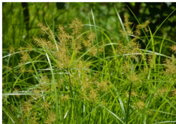
Figure 10. Cyperus rotundus

Next is Cyperus rotundus which is in ninth place. This plant genus is from the Cyperaceae family. In Indonesia this plant is known as teki grass. This is actually not a true grass but a sedge. The sedges consist of more than 900 species spread throughout the world, including in tropical and subtropical regions. Some Cyperus species are found growing in aquatic environments, such as swamps, rice paddies, and river banks, while others grow in drier areas such as savannas and grasslands.