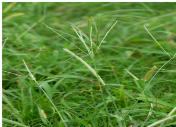
Figure 4. Digitaria ciliaris

The next grass is Digitaria ciliaris , has a fairly high percentage in Table 2, third rank compared to other grasses. This grass is a species of grass that is native to South America, but is now widespread worldwide as an invasive species that often grows in disturbed areas such as highways, golf courses and vacant lots. This species has the ability to grow quickly and spread easily, which can lead to competition from native grass species and reduce biodiversity (Anderson et al., 2021).