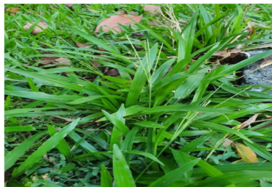
Figure 5. Paspalum conjugatum

Paspalum conjugatum or in English known as Buffalo grass which ranks fourth in Table 2, is a grass species originating from South America, but is now widely distributed throughout the world as an invasive species. This grass is usually found in tropical and subtropical areas, and can grow in a variety of soil types including sandy soils, and clay soils.