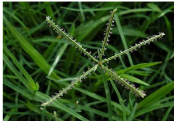
Figure 2. Cynodon dactylon

Cynodon dactylon , or what is often called Bermuda grass, is a type of grass that comes from tropical and subtropical regions, including Asia, Africa and South America. This grass has small and thin leaves and can grow quickly on arid and less fertile soil (Kamchoom et al., 2022). Cynodon dactylon is also used as a green grass in many places around the world, especially in areas that are arid and difficult to cultivate. This grass is also often used as animal feed because of its good nutritional content, in some places Cynodon dactylon is considered an invasive species because it can spread quickly and take over areas that should be occupied by native grass species. Therefore, the use of this grass needs to be considered properly and controlled so as not to damage the existing ecosystem.