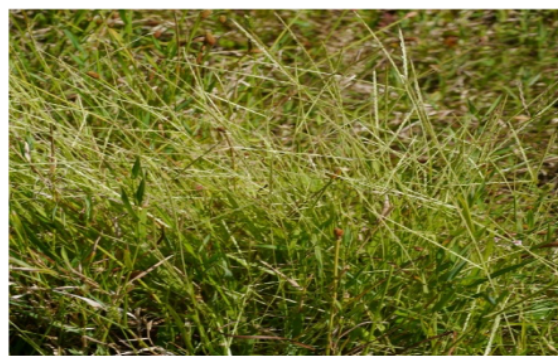
Figure 6. Dimeria omithopoda

Although Paspalum conjugatum can provide benefits as animal feed and as a raw material for food processing products such as flour, as an invasive species it can be a problem for the native ecosystems where it grows. This grass has the ability to grow quickly and spread aggressively, so it can outcompete native grass species and reduce biodiversity.