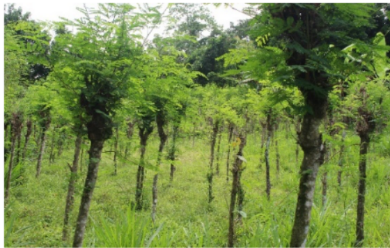
Figure 1. Lamtoro tarramba ( Leucaena leucocephala cv. tarramba)

It was further explained that the use of lamtoro leaves in feed for adult Bali cattle and calves fed basal native grass provides better growth compared to only being given native grass (Putra et al., 2019). The use of lamtoro as a feed plant for cattle has become a common feed on the island of Sumbawa.