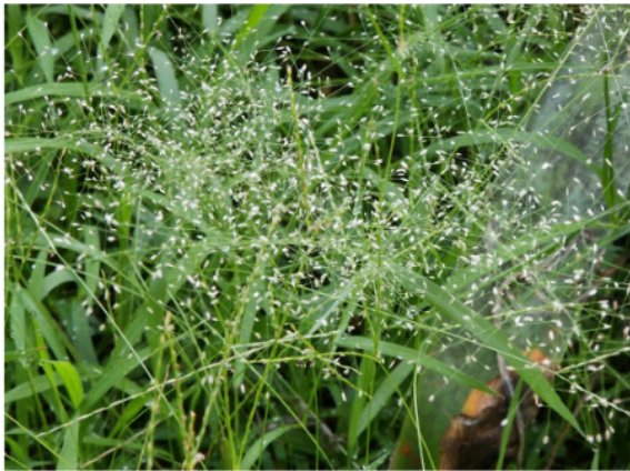
Figure 7. Eragrostis tenella

Next, Eragrostis tenella in Table 2, is in sixth place. This plant is a species of grass that is native to Africa, but has now spread to many parts of the world including North America, Asia, Australia and New Zealand. As a species that is tolerant of various soil types and climates, Eragrostis tenella has spread widely to various habitats such as vacant land, roadsides, grasslands, and other disturbed areas.