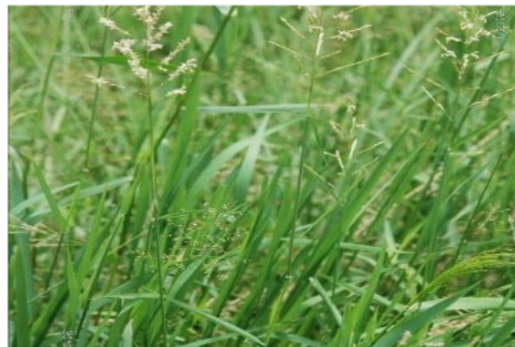
Figure 11. Leersia hexandra

Leersia hexandra is a type of plant that belongs to the grass family (Poaceae). In Table 2 this grass has a lower percentage compared to Cyperus . This plant originates from Southeast Asia and East Asia, including Indonesia, the Philippines and China.