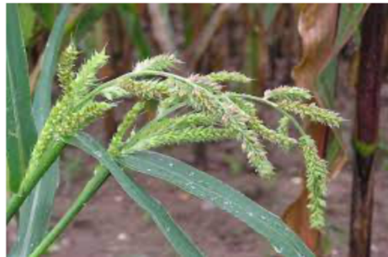
Figure 9. Echinochloa sp.

Dactyloctenium aegyptium , also known as Crowsfoot grass, is a species of grass native to warm climates around the world, including Asia, Africa, America and Australia. This species usually thrives in dry, infertile soils such as clay, sand, and rocky soil. This grass is known as a grass species that is highly adaptive and tolerant of various environmental conditions, such as extreme temperatures, drought, and infertile soil conditions (Koura et al., 2022). This species grows rapidly and has the ability to spread aggressively via seeds and stolons.