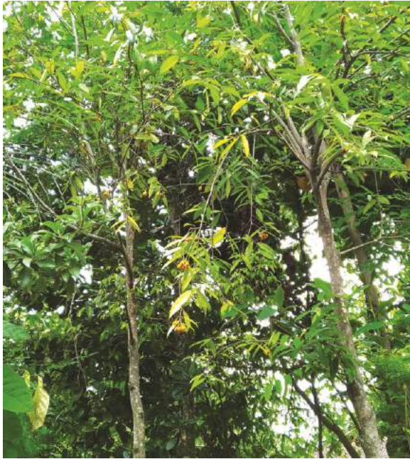
Fig. 1 — Young agarwood tree