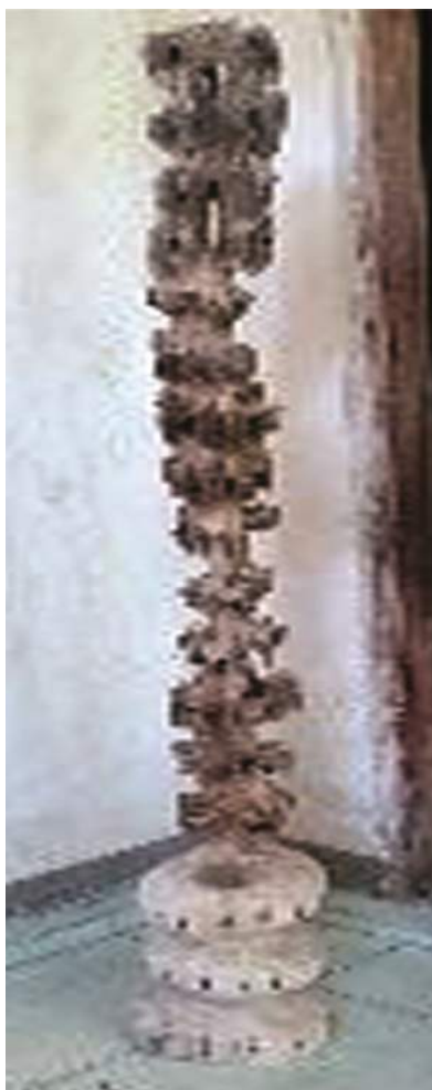
Fig. 5 — Agarwood handcrafts

low-quality agarwood stem with agarwood resin (generally from Pantai group) that has been scented with better resin from another group (such as Kalimantan agarwood). G. versteegii Pantai group is a special resin-producing eaglewood that can be inserted into ordinary or low-quality eaglewood stem, after being given a better quality aroma from another agarwood. The aromatic resin of G. versteegii Pantai group has a less sharp aroma (maybe due to low oil content) so that the craftsmen usually use the resin to insert into ordinary agarwood stem. A phytochemical test based on the content of lignin, cellulose, hemicellulose, total sugar, total starch and resin, agarwood of Pantai group has a close relationship with the Beringin group 21 .