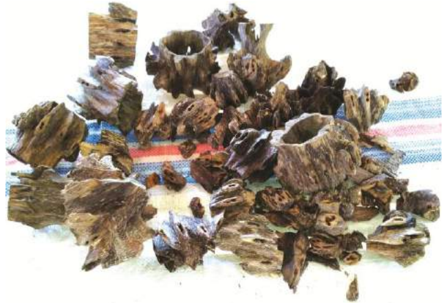
Fig. 3 — Cultivated agarwood

as ants). Meanwhile, the artificial resin could be obtained through fungal inoculation or local formulas (inoculation liquid made from herbs by local people) which are applied using the nailing method (Fig. 4) or zinc-plate method. Fungi that are usually used for