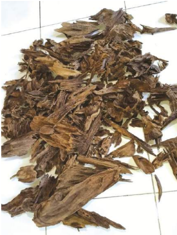
Fig. 2 — Natural agarwood

as ants). Meanwhile, the artificial resin could be obtained through fungal inoculation or local formulas (inoculation liquid made from herbs by local people) which are applied using the nailing method (Fig. 4) or zinc-plate method. Fungi that are usually used for