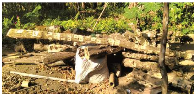
Fig. 6 — Agarwood craft-waste

Craft waste as carved remnants (scrapings) is generally collected (Fig. 6.), then sold, refined and extracted to obtain agarwood oil which is then sold as a fragrance. Waste is generally sold to Java or sold to communities (especially Arabian