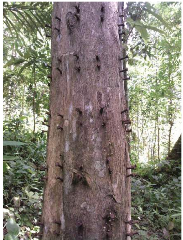
Fig. 4 — Nailing method

inoculation are Fusarium lateritium and Fusarium popullaria . Harvesting can be done in 6 months after being inoculated using fungal inoculum, but if the harvest is too late the plant will be damaged or fail in producing the resin. Agarwood farmers prefer to use local herbal ingredients they called “vaccine” for inoculation, for safety reasons in harvesting.