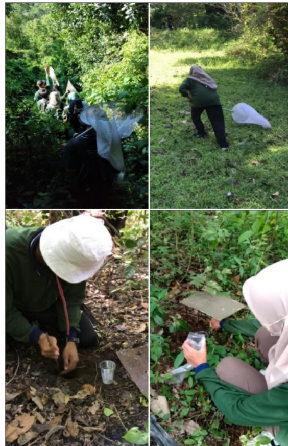
Figure 2. Arthropod sampling in Kerandangan National Park using nets (top) and pitfall traps (bottom)

Once the arthropods were collected, students proceeded to bring them to the laboratory where they would identify them at the order and family level. The lecturers provided assistance to students during this process of arthropod identification. The students' laboratory activities are illustrated in Figure 2.