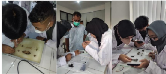
Figure 3. Open inquiry practicum activities in the biology laboratory

To evaluate the initial abilities of the students, a pretest was administered before the Invertebrate Zoology practicum was conducted. The pretest consisted of a science process skills test in the form of an essay question and was given to both the control and experimental groups. After completing the practicum, a post-test was conducted to assess the students' learning outcomes. The practicum topic focused on the collection and identification of arthropod animal groups, which was carried out by both the control and experimental classes. The control class was given practicum instructions, while the experimental class designed experiments based on literature searches and discussions with the practicum lecturer. Table 1 presents the results of the post-test, which assessed the science process skills of both the control and experimental groups.