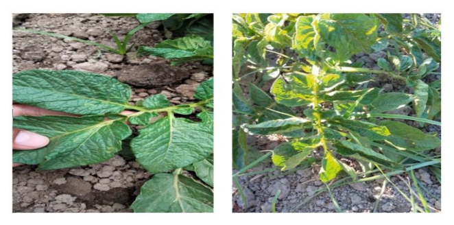
Fig.5. Symptoms of suspected PVY (left) and PLRV (right) viruses in Sembalun Bumbung

those caused by other viruses, 2) two or more viral infections often occur in one plant, 3) virus multiplication in susceptible plants does not always cause visible symptoms, 4) not adaptive (not suitable) for presymptomatic diagnosis (before symptoms appear). Due to the limited diagnosis of the virus, it is necessary to have a method that has better prospects, namely a specific, fast and sensitive virus detection device [17]. The characteristic symptoms of the PVY virus found in potato plantations are a mosaic on the yellow leaves, and the symptoms of the PLRV virus are the leaves rolling up to form a tubular shape, the color of the leaves is more rigid, the color of the leaves is yellowish. The following are symptoms suspected of being infected with the PVY and PLRV viruses in Figure 5.