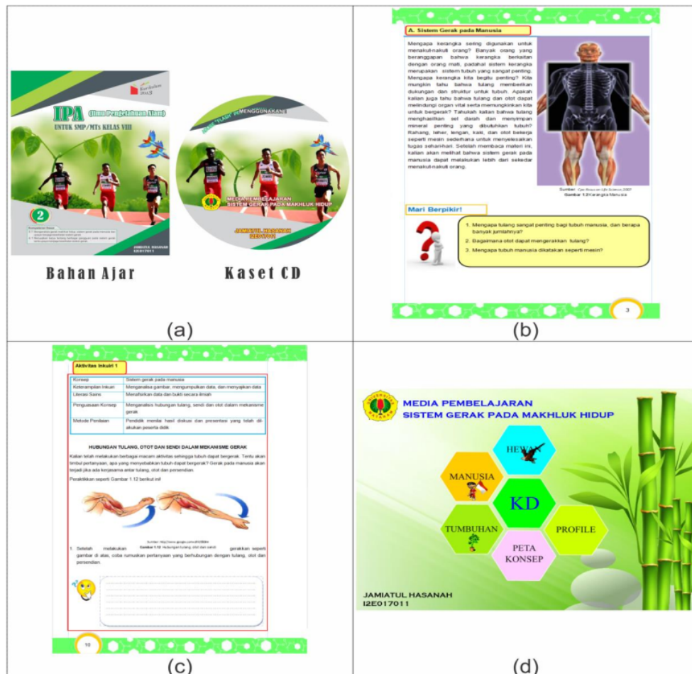
Figure 1. The display examples of science teaching materials (a) Forms of materials developed; (b) Material; (c) Inquiry activities; (d) Display of animation media.

This Science teaching material is related to the materials about the movement system of living creatures and predominantly contains knowledge aspect (facts, concepts, principles, and procedures), attitude aspect, and skill aspect. Figure 1 below is the example of display science teaching materials structured inquiry based with animation media assistance which had been developed.