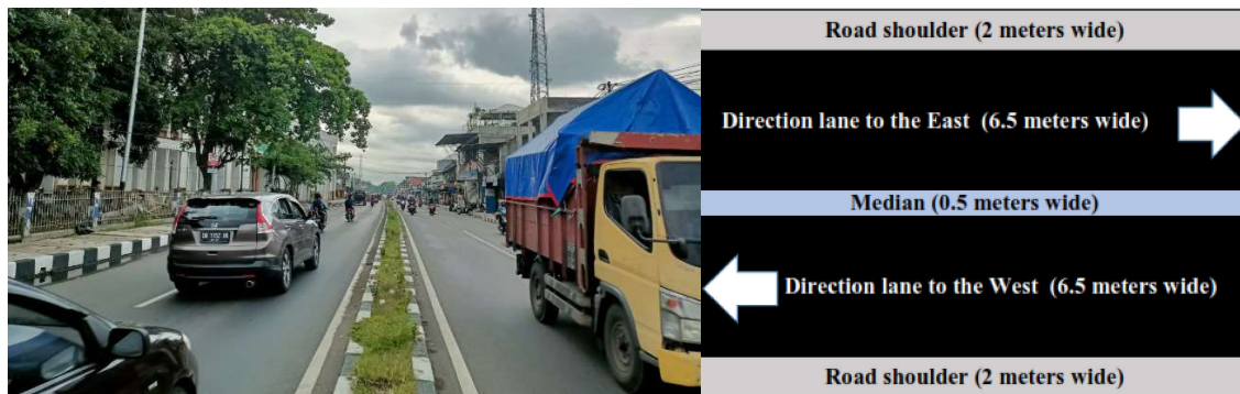
Figure 2. Section road condition with median type 4/2 D

Based on the direct measurement survey in the field, the geometric conditions of the research site roads were obtained. The road section under consideration has a flat terrain type with asphalt pavement. Traffic lane width per lane E-W and W-E is 3.25 and 3.25, respectively. The median width is 0.5 meters, with the road facility as a curb. The distance between the curb and the barrier for each side of the road is 1.0 meters.