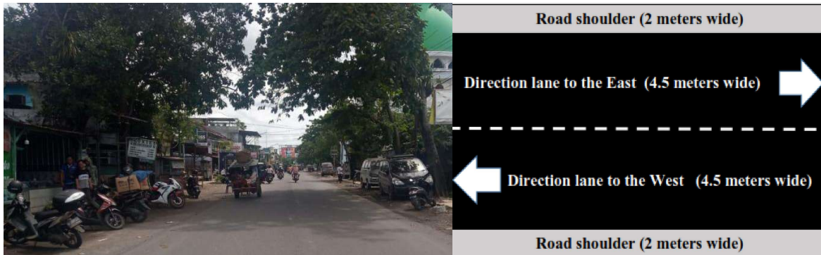
Figure 1. Condition of section road without median type 2/2 UD