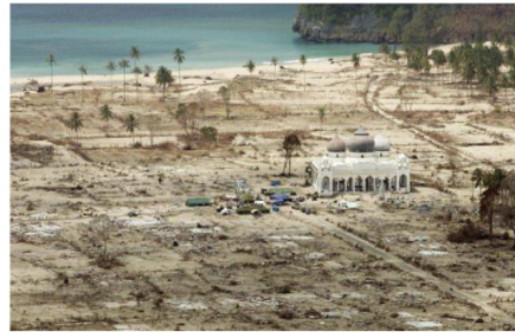
Fig. 3. The impact of Aceh's Tsunami in 2004

occurred in Aceh in 2004. Tsunami events are better known as the result of earthquakes. One example of the impact of the Aceh tsunami is shown in Figure 3, which caused a huge devastation in the land of Aceh.