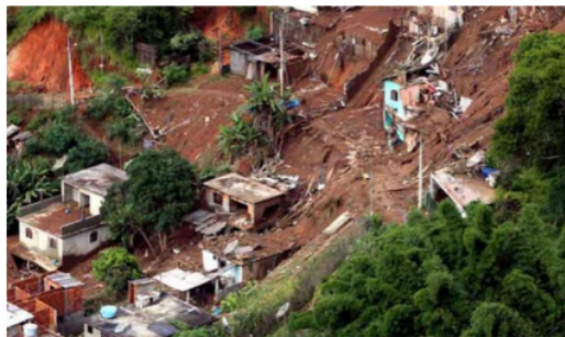
Fig. 1. landslide due to heavy rain in Guntur Macan Village ( https://pesisirnews.com/Peristiwa/Korban-Tanah-Longsor-di-Lombok-Barat )

The word "landslide" which some of primary school students who are subjects of research are still unfamiliar. After showing at the beginning of the learning, students realize that the land collapsed or dropped. Landslides are a form of rock mass movement that can cause disaster for people who live in an area. Landslides often occur in slope or cliff areas [2]. Landslides can occur due to a strong earthquake or heavy rain that flush the slopes or cliffs. One example of landslides due to heavy rain in the cliff area in the village of Guntur Macan, Gunungsari district, West Lombok in 2015 due to heavy rainfall in the cliff area (Figure 1). Using comic illustrations (Figure 2), understanding of the dangers and causes of landslides easier for students to understand.