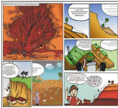
Fig. 2. Comic book about landslide(Yukni, 2011)

Likewise with the word "Tsunami", students need further explanation. They understood the meaning of tsunami after seeing the incident on a short film about the tsunami that