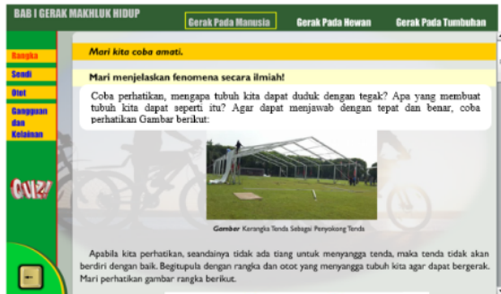
Figure 1. Indicators of scientific literacy.

The product resulting from this development research is an e-book application. This e-book product was created and designed by the researcher himself, with the aim that it can be used as a teacher's tool in conveying material and also as an independent learning resource that can be used at any time by students outside of school. Some displays of e-book media are presented in Figure 1-3.