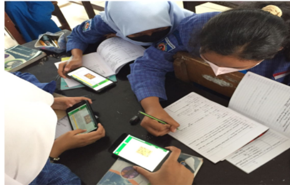
Figure 4. Learning using e-book media

collaboratively. Classroom learning activities are presented in Figure 4-5.