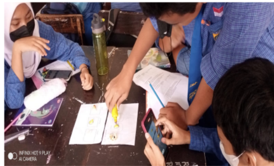
Figure 5. Collaborative and thorough practicum

Based on the results of the research, a summary of data on acts of bullying was obtained as shown in Table 1. Based on Table 1, the t-test significance value of 0.00 is smaller than the significance level (0.05). These findings imply that the use of character education integrated inquiry e-books has an effect on students' acts of bullying. One of the indicators affecting the reduction of bullying is the existence of character education that is integrated into e-book media. In the e-book media, information services are provided using video media about understanding bullying behavior, so that students can understand the content of bullying material better. Those who experience changes through the provision of information services using video media. Apart from that, the e-book is also facilitated with actions that fellow students may not take, as shown in Figure 2. In addition to minimizing acts of bullying, this e-book can also improve students' higher-order thinking skills, because it has also been facilitated with phases phase of the inquiry learning model.