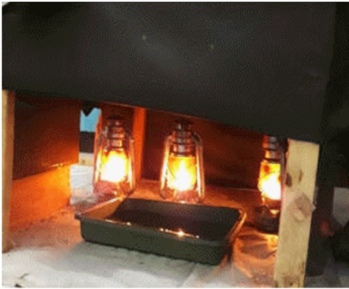
Photo 1. Kerosene mini stove for heating the sawdust