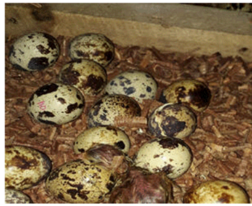
Photo 2. Sawdust as incubator for quail eggs