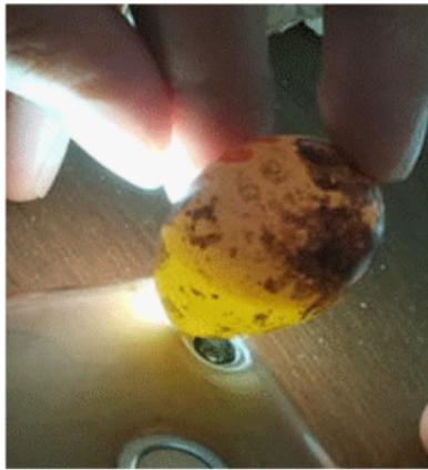
Photo 3. Candling on day 5