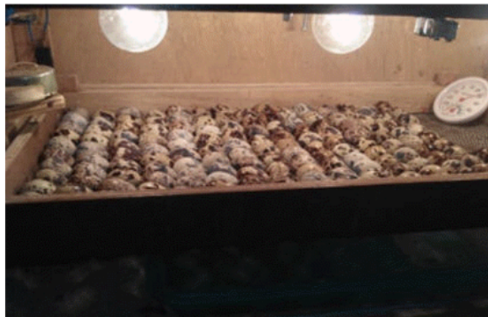
Photo 5. The plywood electric incubator