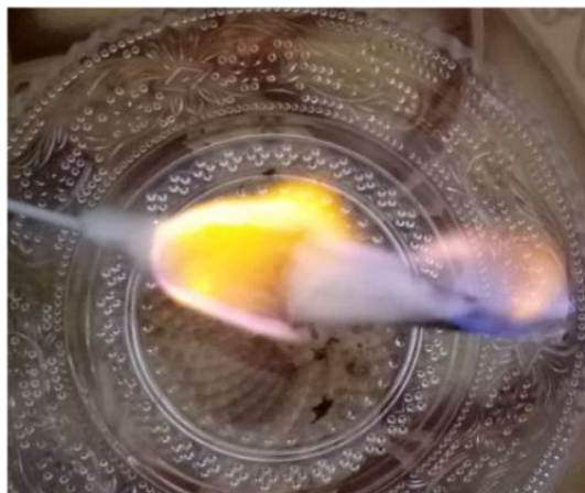
Figure 2. MF bioethanol and premium flame test.