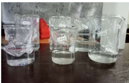
Figure 3. Palm sap bioethanol produced in this study.