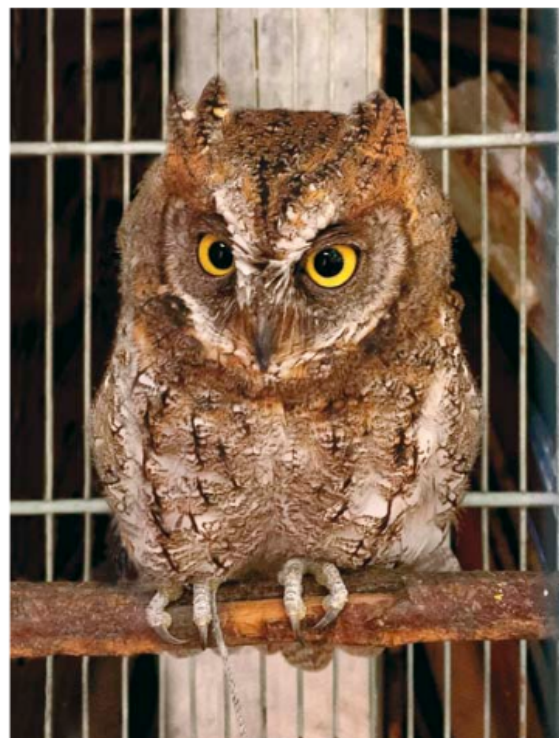
Plate 1. Rinjani Scops-owl Otus jolandae for sale at Pasar Chakranegara in Mataram, Lombok, Indonesia, June 2019.

While Rinjani Scops-owl is similar in appearance to Moluccan Scops-owl O. magicus (Lesser Sunda Islands of Sumbawa, Komodo, Flores and Lembata, and the Moluccas) and Wallace's Scops-owl, all traders in 2019 confirmed that the birds on offer were caught on Lombok, ruling out other possible species. Several traders indicated that they themselves had taken the birds from the wild, stating that the species is relatively common and easy to capture, especially during the breeding season when it nests in and around plantations.