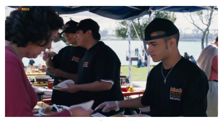
Image 11 The image is a donation event made to raise money for calling Miep Gies, they are all very enthusiastic and working together and cooperation to raise funds

The image is a donation event to collect money for calling Miep Gies (Holocust victim) they are all very enthusiastic and working together and cooperation to raise funds.