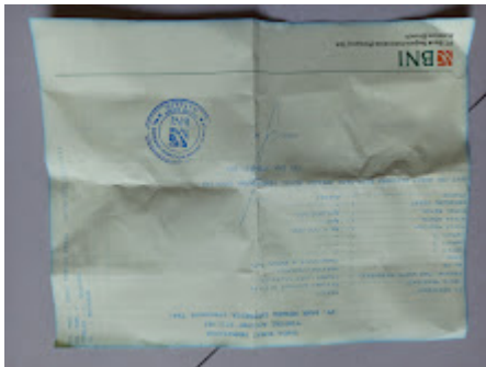
BUKTI BAYAR ARTIKEL JPII UNES.jpg 1061K