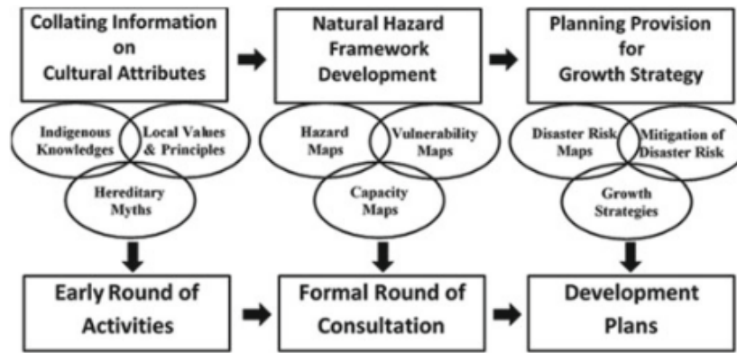
Fig. 4 Conceptualization of incorporating cultural attributes into development plans

has the opportunity to incorporate traditional knowledge, values and practices into disaster-related development plans. The community can persuade government that the community perspective in disaster management and recovery initiatives are relevant to the government plan.