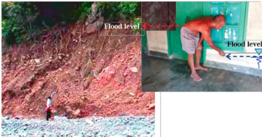
Fig. 3 Flood level-marking based on personal information

the determination of flood elevation plans in the planning of river embankments pay attention to traces of flooding based on hereditary experience of the surrounding community (see Fig. 3).