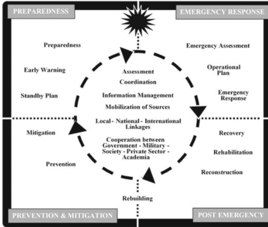
Fig. 1 Disaster management cycle (adopted and translated with permission from Setianto [4])

addition, the readiness of data management and geospatial information is very necessary to minimize losses and accelerate the rehabilitation and reconstruction process in the affected areas.