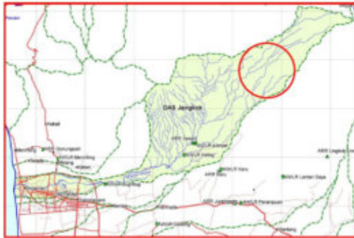
Fig. 1. Measurement location of flow discharge and suspended sediment

Lombok Island (Fig. 1). Six measurement points were selected based on the field condition. Tembiras River was divided into upstream (T1) and downstream (T2) locations, while Jangkok River was divided into Jangkok upstream (J1) and Jangkok downstream (J2). A point each was selected in smaller tributaries called Bentoyang River (B) and Pemoto River (P). The number of samples for each location was 24 samples or 148 samples in total.