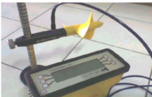
Fig. 2. Flowmeter of Valeport Model 001

Flow discharge at a predetermined location was observed. The flow velocity was measured by flow meter wading set as shown in Fig. 2, whereas the water assessment was carried out between tributaries to the main river. To obtain representative data on flow velocity measurements and water assessments, measurements were made during rainy and dry seasons.