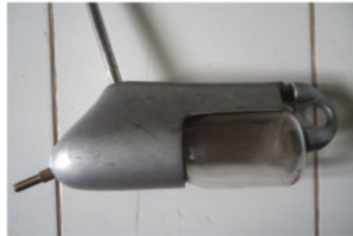
Fig. 3. Suspended sediment sampler of US DH 48 type

The measurement of suspended sediment concentration was carried out at the same location as the flow velocity and water assessment. Measurements were made using a suspended sediment sampler and a cylinder water sampler as shown in Fig. 3 and Fig. 4. In terms of proportional dimensions, a cylindrical measuring instrument can provide more accurate measurement results with a trapping efficiency of 0.8-1.2 for a moderate velocity [19]. Filtering and weighing samples were carried out to separate sediment contained in the water sample. Measurements of flow discharge and suspended sediment concentration were carried out as much as possible at various locations so that the existing samples represented the actual condition of the river.