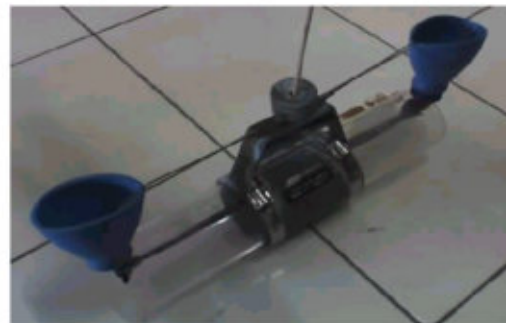
Fig. 4. Cylinder Water Sampler of LaMOTTE Model JT-1

In addition to field measurements, secondary data in the form of hydrological, climatological, land use, and other technical data were prepared. Watershed-related