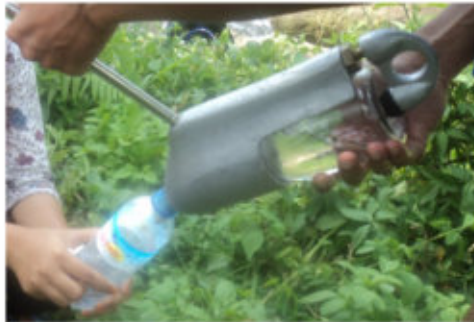
Fig. 6. Removal of sediment from US DH 48

problem faced during this process was the measurement results with very little suspended sediment content, making it difficult for the drying and weighing processes. Therefore this series of work was carefully executed to obtain accurate results.