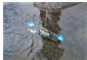
Fig. 5. Sediment sampling measurement using Cylinder Water Sampler (LaMOTTE Model JT-1)

Suspended sediment measurements were carefully carried out at a location with minimum disturbance and no backwater influence (Fig. 5). This was intended to allow the suspended sediment to enter the sampler in a very smooth fashion. Following the measurement, trapped sediment was removed and stored in a bottle or a container (Fig. 6). Twenty-four samples for each location were labeled for further analysis in the laboratory.