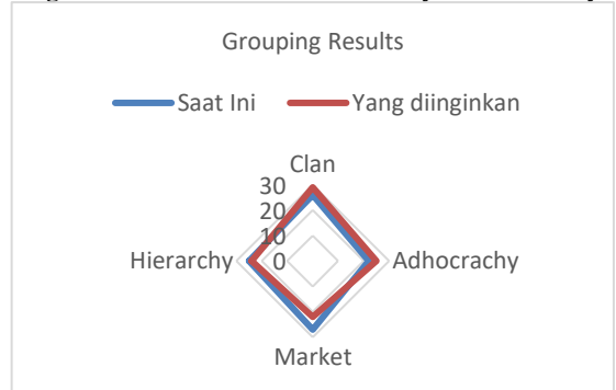
Figure 4.7 Current and Desired Cultural Radar Diagram

While the "desired" organizational culture is dominated by clan culture by 29 points.