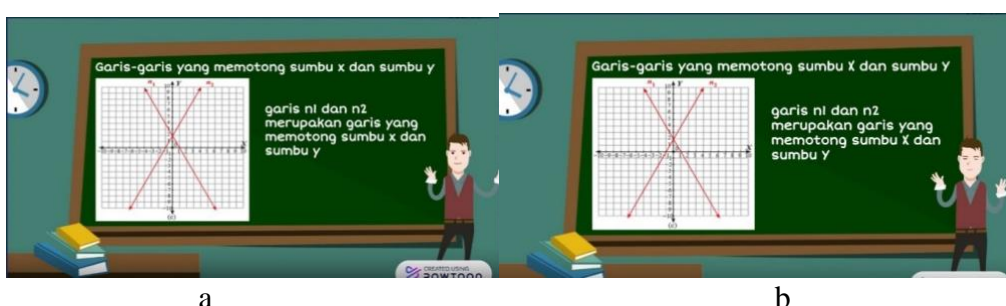
a b Figure 3. a) Before and b) After Axis Label Revisions

After the validation stage, the practicality of the instructional media is assessed. According to Khofifah & Kamalia (2022), instructional media, in this case, Powtoon, is considered practical based on student responses. The practicality of the mathematics instructional media based on Powtoon is determined through the results of the student response instrument administered during a limited trial to 24 eighth-grade students at SMP Negeri 13 Mataram. The practicality rating for the mathematics instructional media based on Powtoon, based on student responses, is 84.6%, categorized as "very practical." This indicates that the media is highly practical for use in the classroom. The results of the practicality analysis can be seen in Table 5.