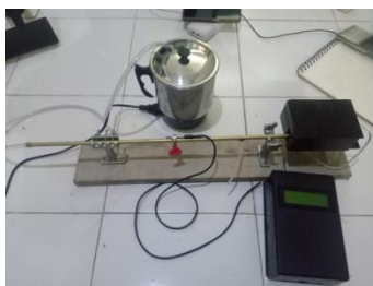
Figure 1 Digital Heat Expansion Based on Arduino Uno

The steam that flows will cause the temperature of the metal to increase. The temperature increase in the metal will be read on the LCD by bringing the temperature sensor closer to the metal. Before use, the temperature sensor and distance sensor are calibrated first. Product feasibility is obtained from validity and reliability tests. Validation is carried out to test the correctness of the devices and products being developed. Validation of products and supporting devices is carried out by three expert validators. Validation results are presented in Table 5