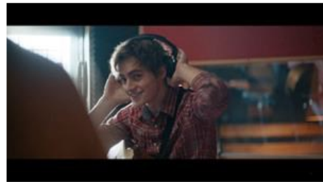
Self-reliance and potential Scene